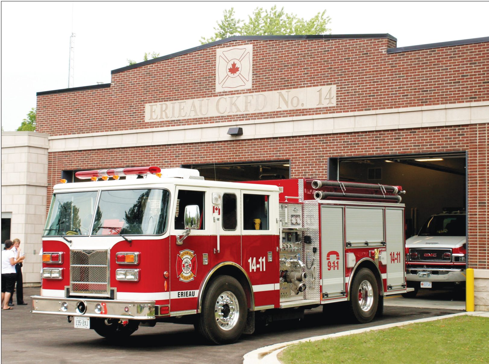
Erieau Fire Station 14 and Community Centre was open and ready for inspection during last Sunday's ribbon cutting.

The municipality received a $1.25 million grant from the federal